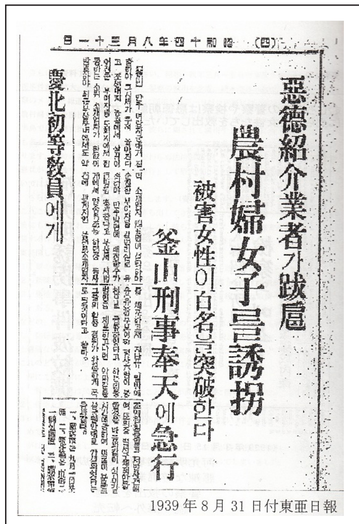
the August 31, 1939 edition of the Korean newspaper Toa Nippo (East Asian Newspaper)

The Japanese authority kept a watchful eye on procurers to ensure that they followed orders. According to the August 31, 1939 edition of the Korean newspaper Toa Nippo (East Asian Newspaper), the Korean police, then under Japanese control, was ordered to arrest procurers who coerced women into serving as comfort women.