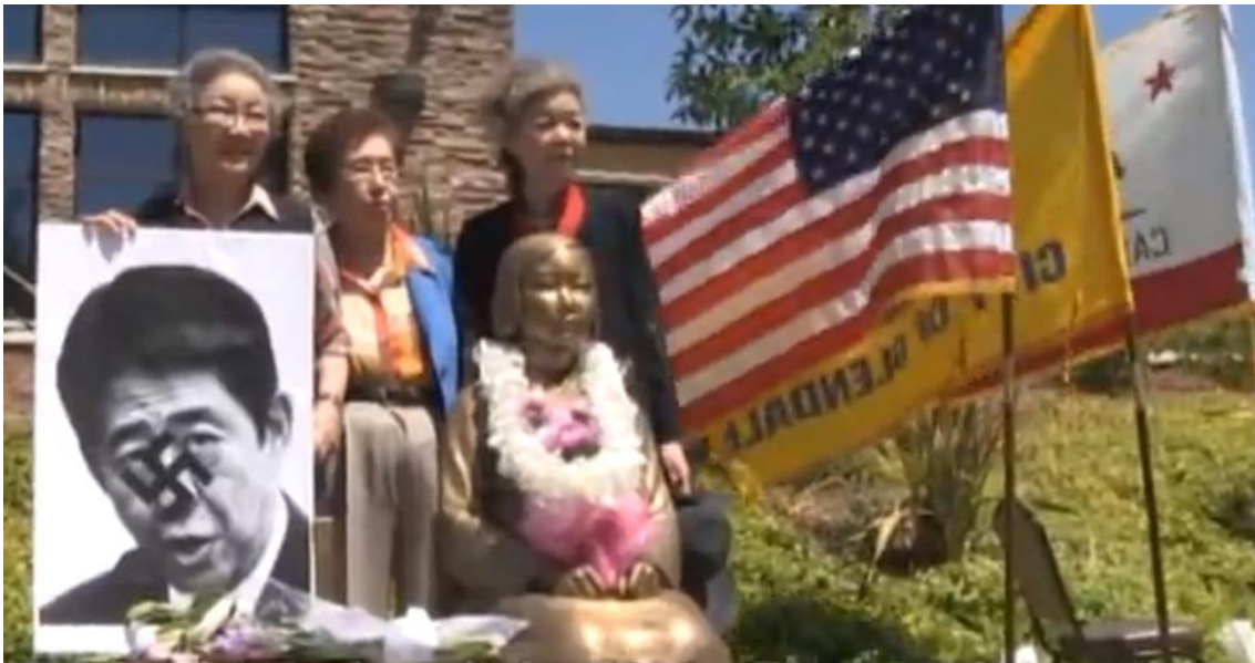
One of the ceremonies held in the U.S. to promote the “comfort women” statue.

Another point is that, we realised young children are naturally susceptible to racial hatred. We are deeply shocked by the fact that small children in South Korea are educated that Japan is an evil at a very young age in their Anti-Japan education system. The following photos are showing drawings by young Korean children which were displayed at a subway station outside Soeul.