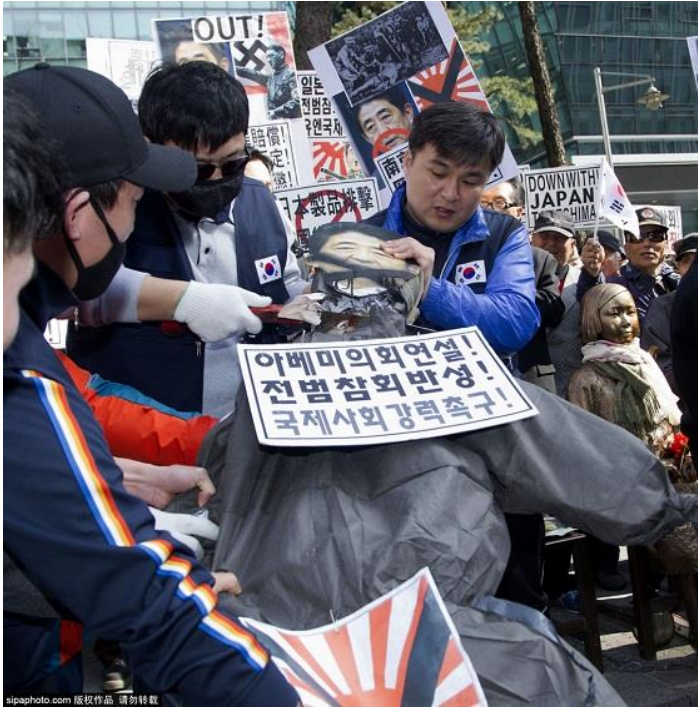
Mr Abe beheaded beside the statue. Photography taken in South Korea